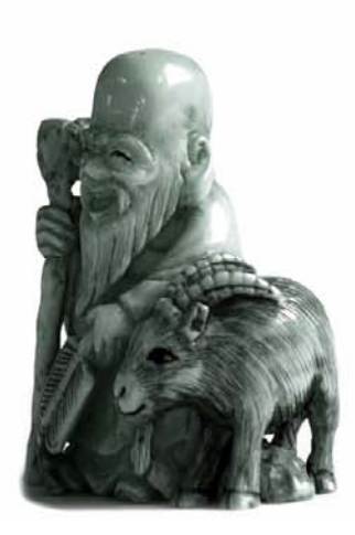
способностью использовать людей и верхом сочетания с небесной древностью.