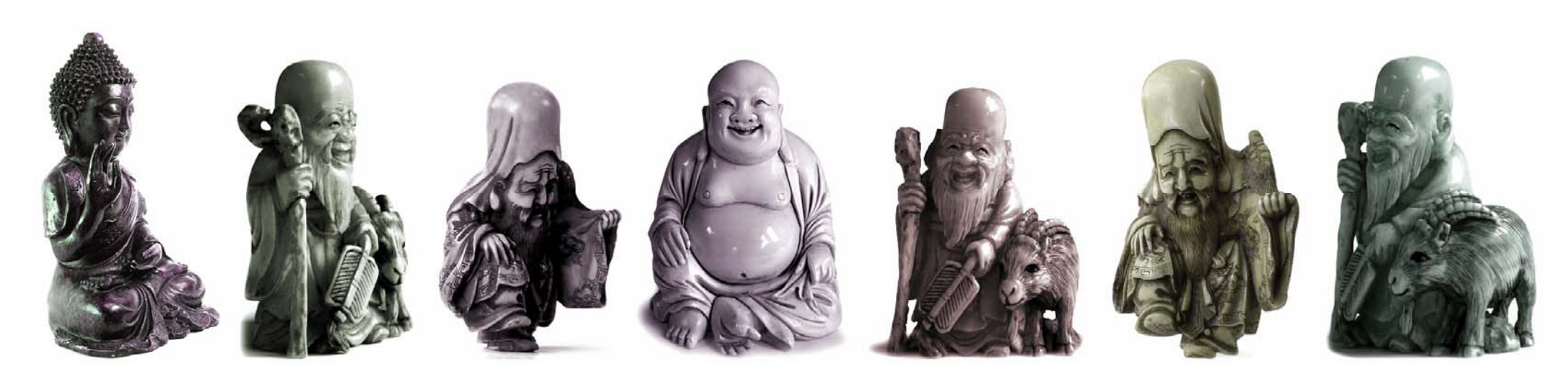
Пользуйся им - за целый век не исчерпаешь.