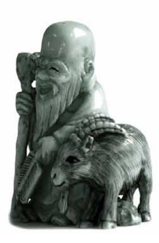
┌╌═╌╎╌═╌╎╌═╌╎╌═╌╎╌═╌╎╌═╌╎╌═╌ PSEUDO-CHAPTER Eightv