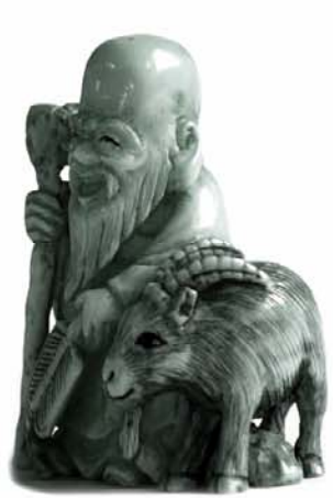
принимают чувство простолюдина как свое. Добрых людей я принимаю уже потому одному, что они добры. Злых принимаю, как добрых. Искренним людям я верю; также и верю неискренним, ибо в этом и состоит верх искренности. Когда святые живут на земле, то они просты и тихи; они питают ко всем одинаковое чувство. Для (блага) мира они делают свои сердца темными. Простые люди будут смотреть на них (как на своих учителей) и будут слушать сказание о их делах.