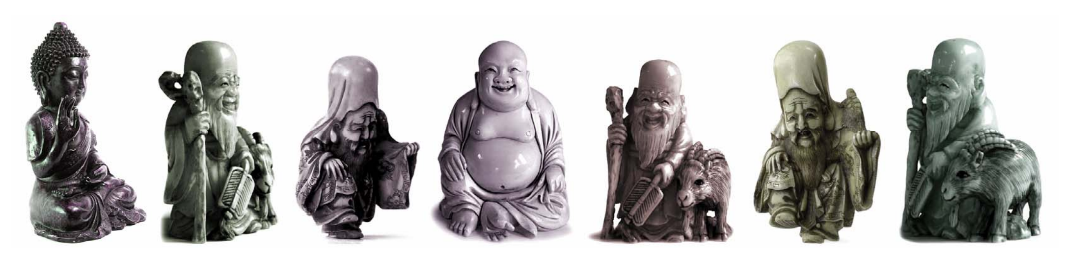
В успехе оказывайся против своей воли. В успехе не будь сильным. Сущность, достигнув пика силы, начинает стареть. Это определяется: Не Путь. Если не Путь, то устраняйся пораньше.