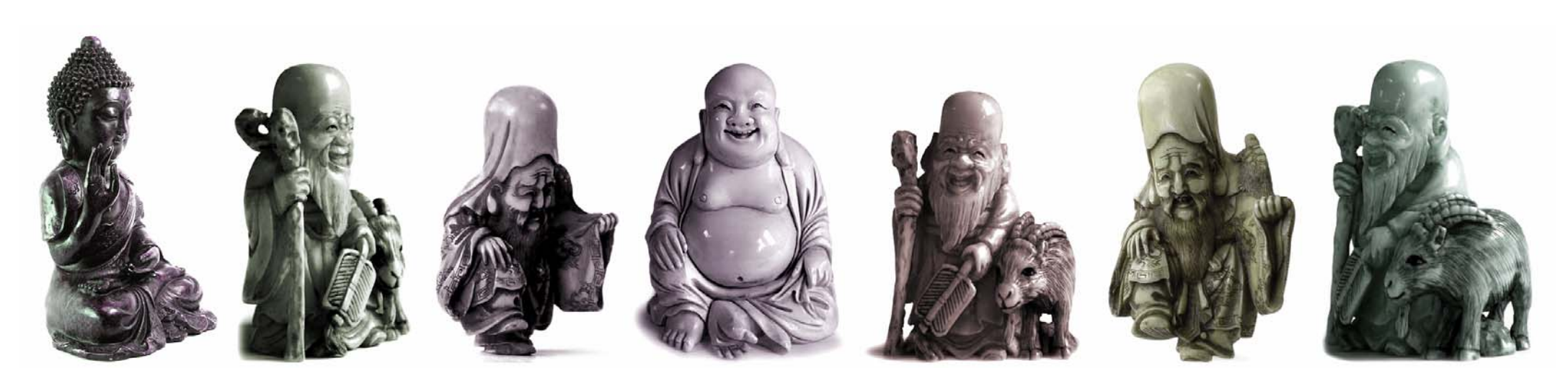
И какова же причинность: Из-за отсутствия в нем Земли смерти.