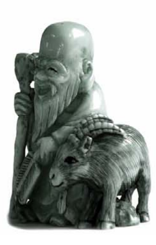
Tranquillity sets the example for the world.

[45c38t] Henry Wei Grand Virtue Huna Teh Great perfection seems imperfect; Its utility will never deteriorate. Great fullness seems hollow; Its utility will be inexhaustible. The most straight appears to be bent; The most skillful appears to be awkward; The most eloquent appears to be stammering. Hastiness subdues cold: Ouiescence subdues heat. Purity and quiescence are the norms of the universe.