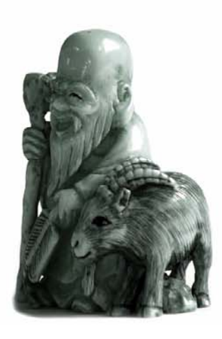
Thus, the Tao is the most highly esteemed thing in the universe.

[62c38t] Henry Wei Practicing Tao Wei Tao Tao is a mystery within all things. It is a treasure to the good men; To the bad men it gives protection. Fine words may be shown at the market place; Noble deeds may serve as gifts to people. Some people may not be good, But why should any of them be discarded? Therefore, when an emperor is enthroned. Or when the three chief ministers are installed, Though they may have fine pieces of jade Respectfully presented before the team of horses, There is nevertheless nothing better for them Than to sit (in meditation) and advance in Tao. For what reason did the ancients prize this Tao? Did they not say: "With Tao one finds what one seeks, And can get pardoned for one's offenses"? Hence Tao is highly prized by the world.