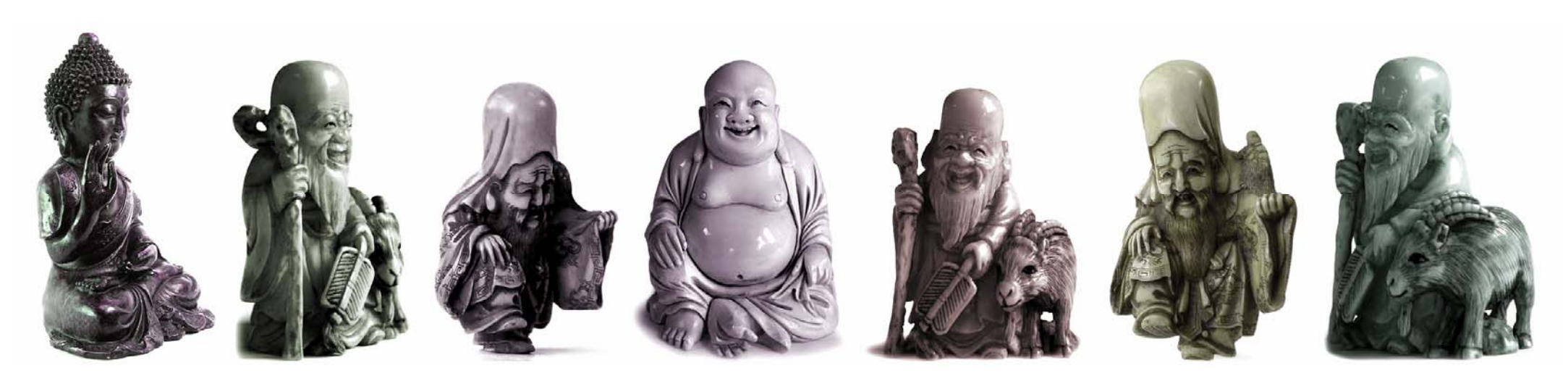
Речь совершенствуется верой. Управление совершенствуется порядком. Ситуация-дело совершенствуется энергией-возможностью. Движение совершенствуется временем. И если только не соперничаешь, тогда - отсутствие просчетов.