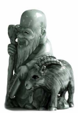
Тот, кто не утратит этого, обретёт долговечность и будет жить долго, не умирая.