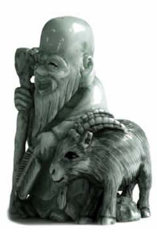
overmuch of it.