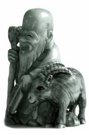
This is the essential secret.